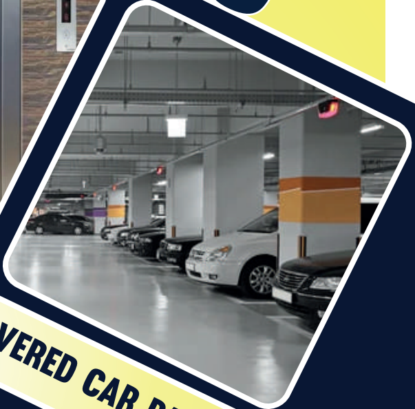
COVERED CAR PARKING