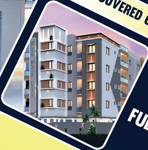
1 YEAR FULL MAINTENANCE