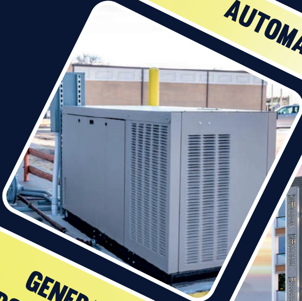
GENERATOR POWER BACKUP